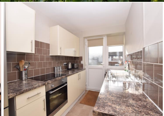
Popular Area Viewing Advised