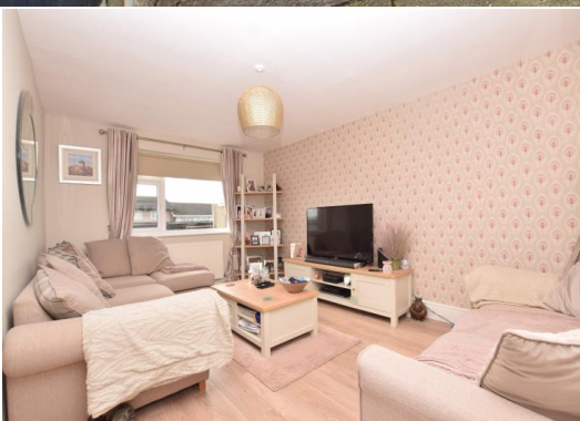
Three Bedroom Mid Town House