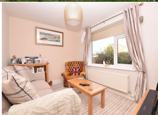
Well Presented New Kitchen